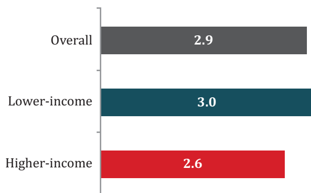
Figure 1: Share of tobacco in household expenditure (%)

Pakistan has comparably high rates of tobacco consumption and tobacco-related illness and disease. Estimates based on Pakistan’s Household Integrated Economic Survey (HIES) 2015–16 indicate that tobacco is consumed in 45 percent of the households in the country . Besides, consumption of tobacco constitutes a sizable portion of household expenditure. Considering the resource constraints of households, tobacco spending leads to reduced expenditure on other goods and services including basic needs such as education, health, food, housing, and others. Therefore, tobacco expenditure has direct bearing on household welfare. The research by SPDC examines the impact of tobacco use on the consumption pattern of households and also explores how reductions in tobacco expenditure affect intra-household resource allocation.